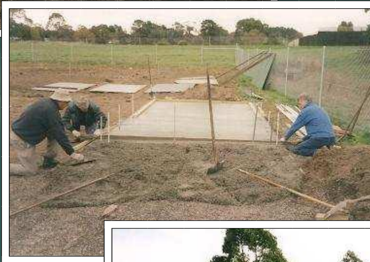
The shed floor