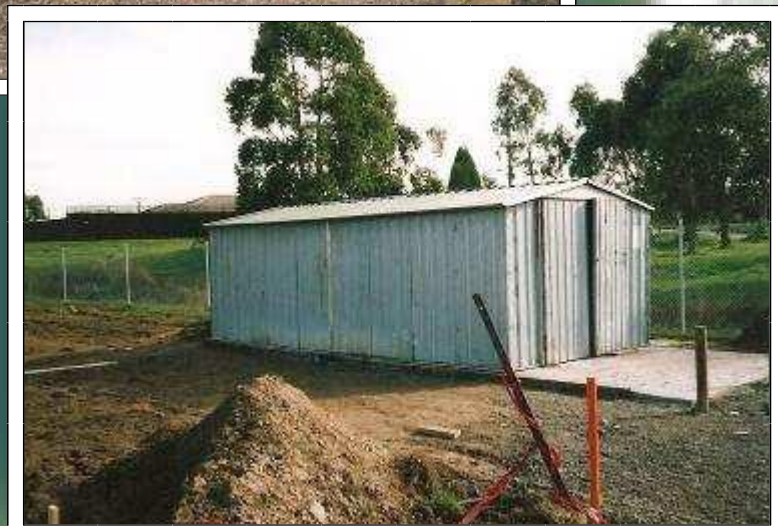
The shed erected